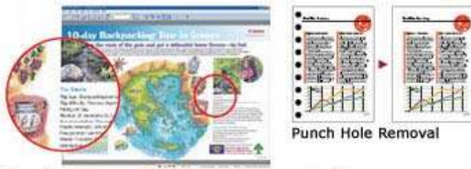
Exceptional image clarity and colour reproduction