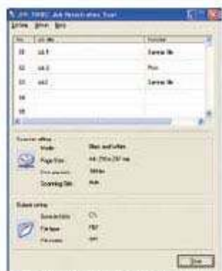
Program up to 199 job presets using the Job Registration Tool