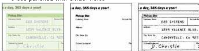
Advanced Text Enhancement II

CapturePerfect is Canon's own scanning application that makes it easy to get great scans straight out of the box. Through a userfriendly interface, the software gives you a wide choice of filesaving formats and file distribution options such as searchable and encrypted PDF, Scan to Mail, Scan to Presentation, and more